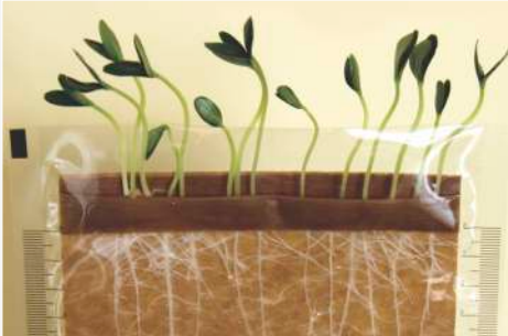
Germination Grade Crepe Paper